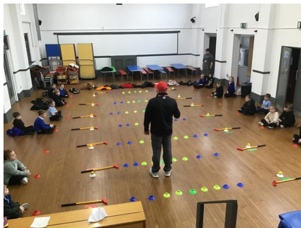
4 - Golf session