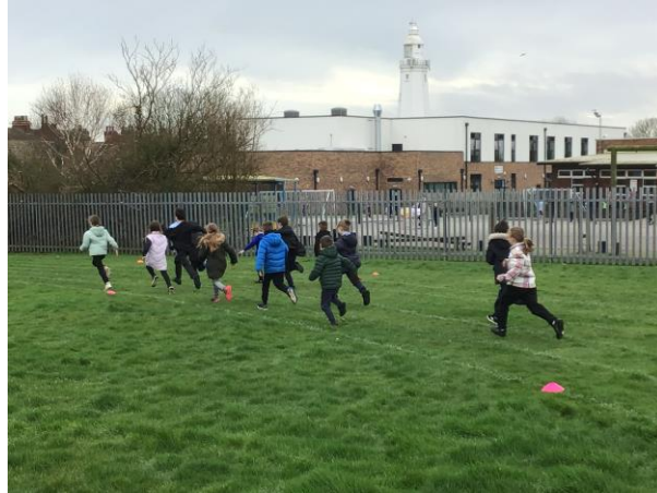
5 - Cross country