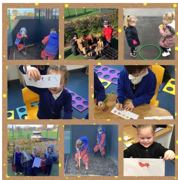
3 - Reception