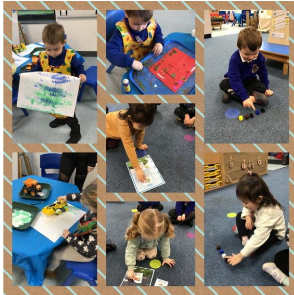
2 - Nursery