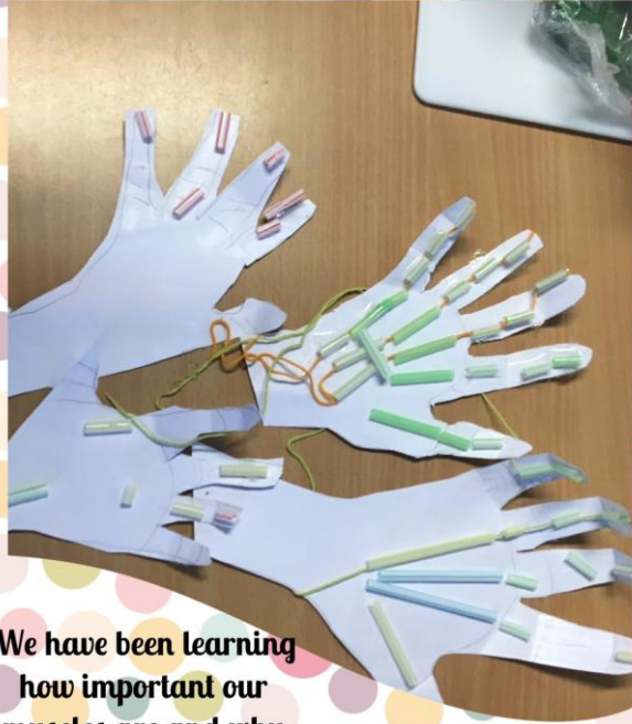
We have been learning how important our muscles are and why we need them. 29.1.24