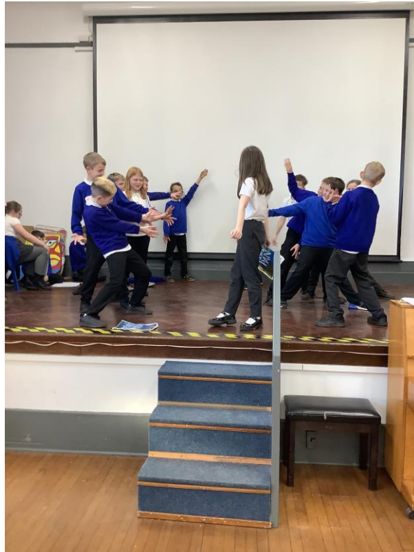
6 - Year 5

This week, we have completed our English mock SATs and started our maths with the arithmetic paper today. The children have shown real resilience and it has been good for them to know what the real SATs will be like.