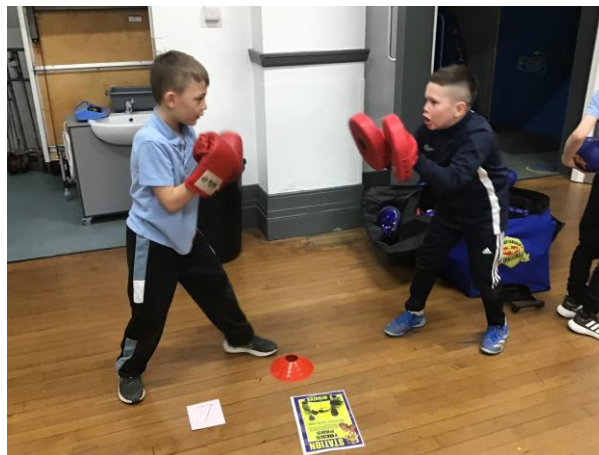
4 - Year 3 Box2Bfit