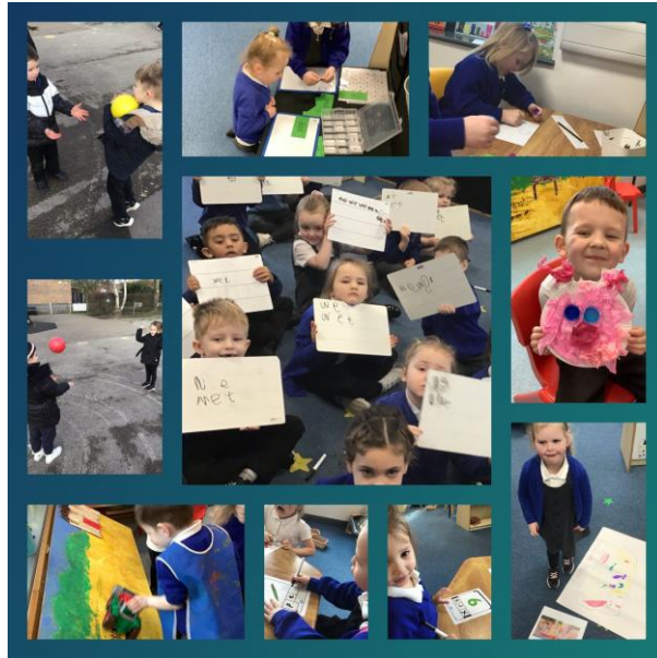
2 - Reception