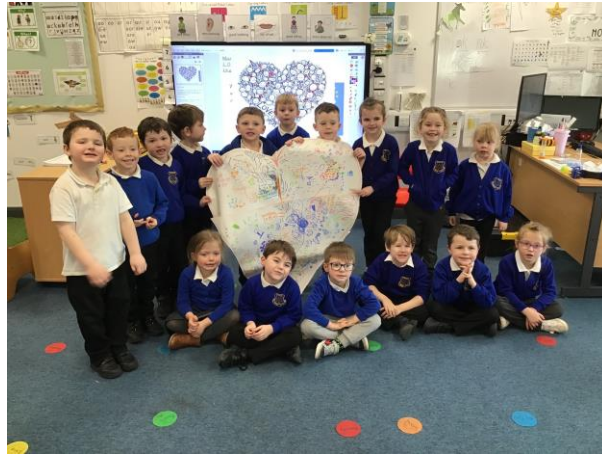
3 - Year 1