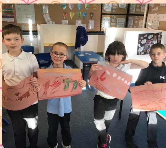
We have learned how Stone Age paintings tell us about the past.