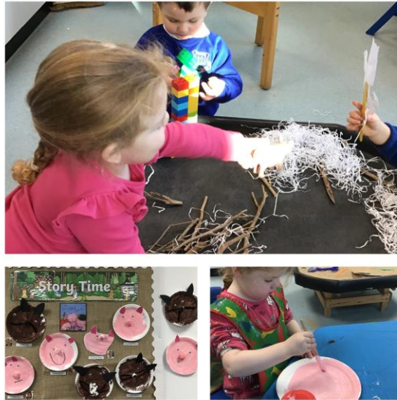
1 - Nursery