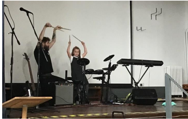
5 - Year 4 - Our new 'rock star

Year 5 have had a super productive couple of weeks! The children have been incredibly resilient working on adding fractions with different denominators in Maths. Their efforts are paying off and they are building their knowledge in this topic well. We have completed our work on Road's End (our tension and suspense narrative) and the children have created some wonderful pieces of writing filled with tension and suspense! We have been learning all about the different land use in both Greece and Canada in Geography using our computing skills on the iPads and QR codes to help us. In Reading we are learning more about our characters in Deadman's Cove and the mysteries are mounting. We have had lots of fun in our non-fiction reading lessons learning about many different islands all over the world and what they are used for. We are all thoroughly enjoying our rehearsals for Peter Pan which encompasses our music and PE focus of signing and choreography. The production is really taking shape and looking fantastic already!