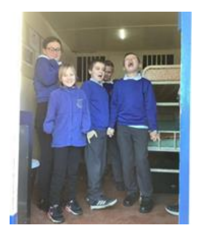
4 - Year 6