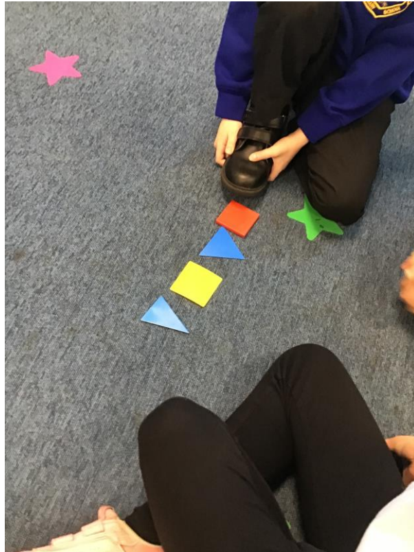
4 - Year 1