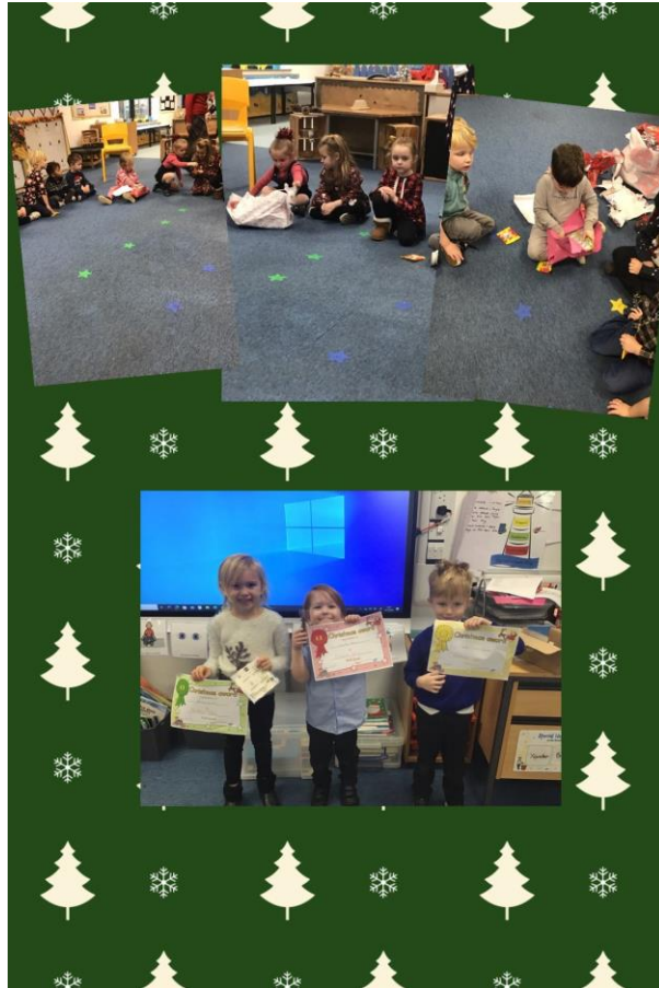
3 - Reception