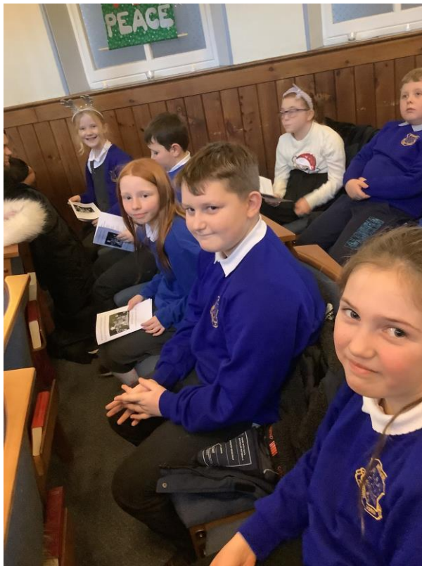
6 - Year 5