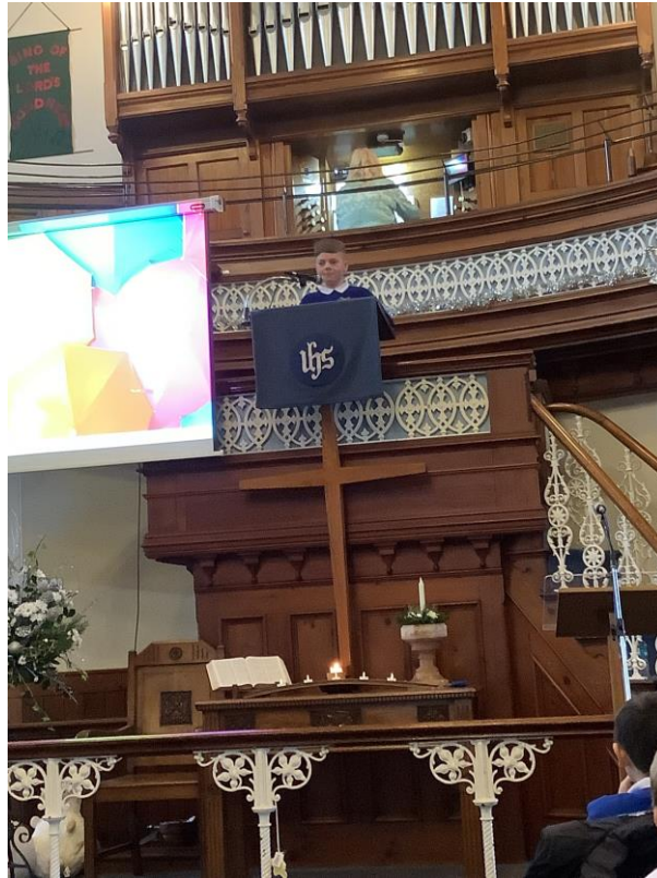
1 - Year 5 and 6 carol service

Year 5 and 6 attended Withernsea Methodist Church for their carol concert. Some children did readings and all of them sang the carols practiced in school. Thank you to the parents and carers who attended, we hope it got you in the mood for Christmas! Also, thank you also to the support from the church who helped us to be able to do this.