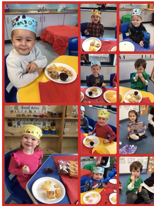
2 - Nursery