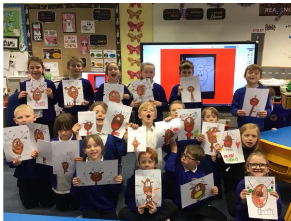
5 - Rudolph the reindeer art.