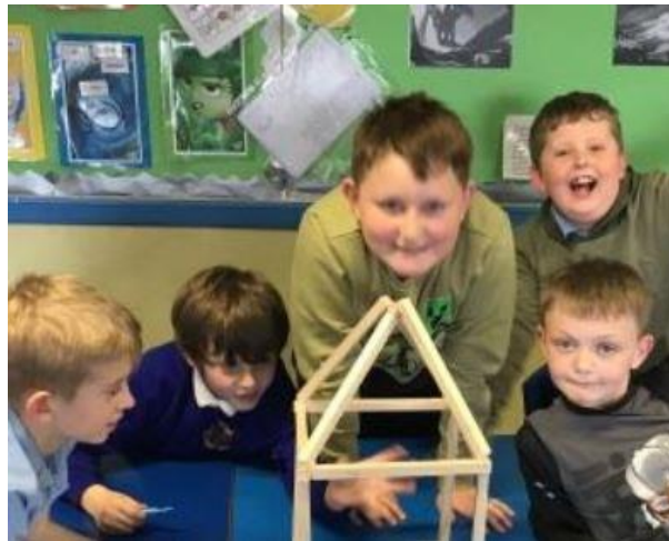
3 - Year 4 - Making the greenhouse in DT.