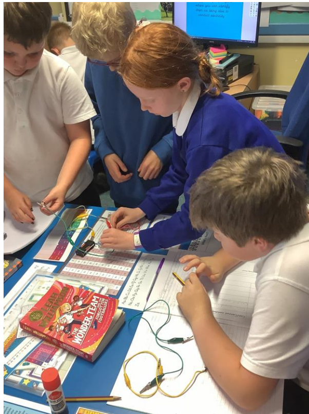
4 - Year 5