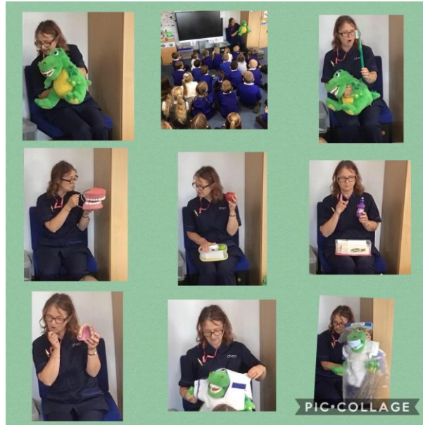
2 - Reception