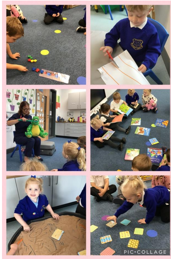
1 - Nursery