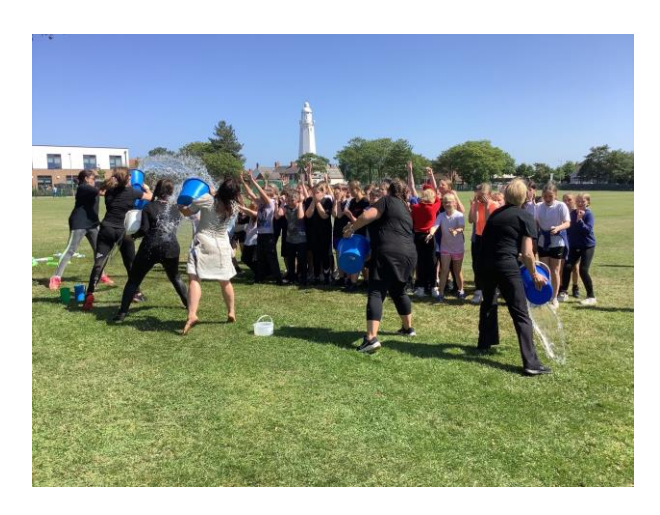
5 - Year 6