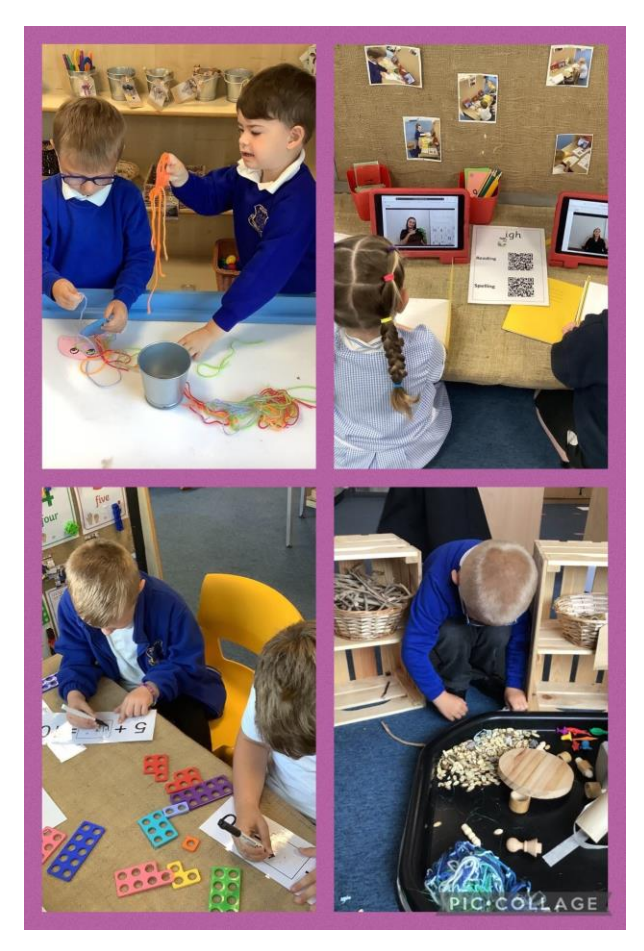
2 - Reception