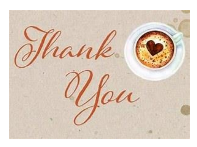
1 - A big thank you to local agencies who supported our coffee afternoon on Thursday.

A number of parents attended and hopefully benefitted from the presence of our SENCO, Wellbeing Workers and local agency expertise and resources.