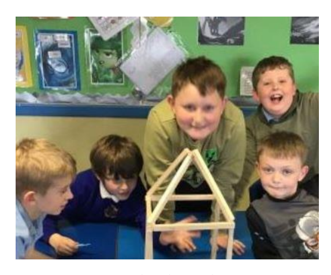
4 - Year 4 - Making the greenhouse in DT.