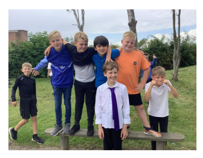
6 - Year 6