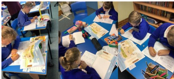
3 - Year 5