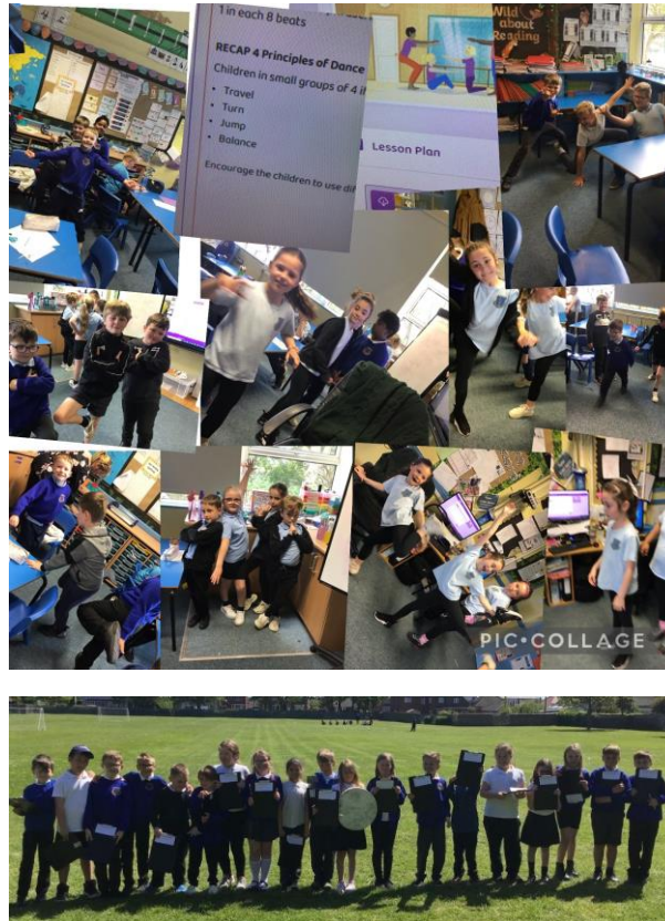
2 - 4ML enjoying the (rare) sun and learning outside. 9/6/23