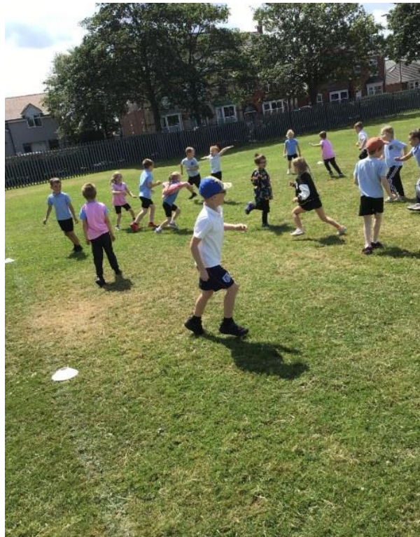
1 - Tigers trust:)