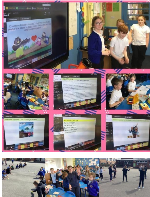
6 - Year 5