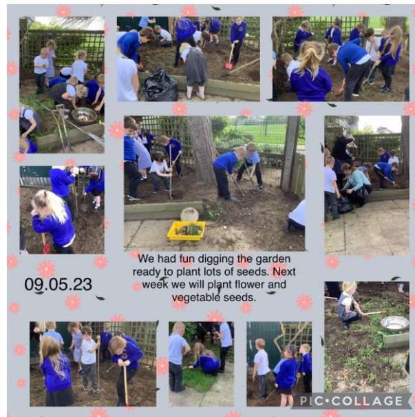
2 - Reception

We have drawn our favourite characters from the story Sam Plants A Sunflower.