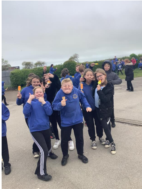
7 - Year 6