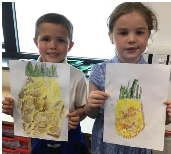
3 - Two amazing pineapples from still life painting in art!

In maths we have been rotating and matching shapes.