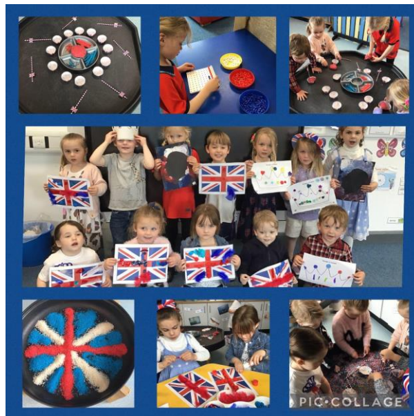
1 - Nursery