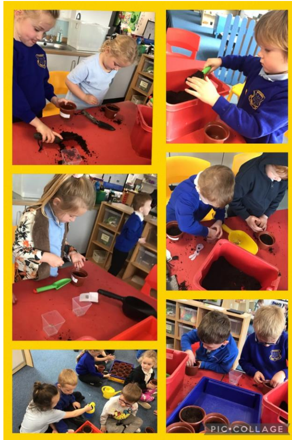
2 - Reception