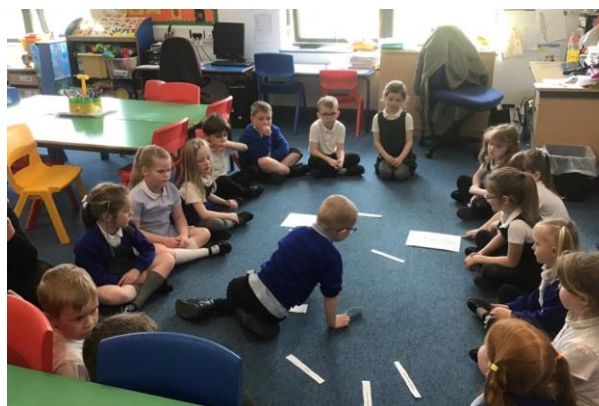
3 - Year 1

We have planted our sunflower seeds and are looking forward to taking care of them and helping them grow!