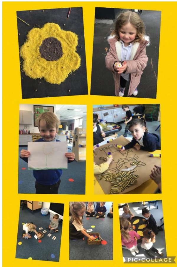
1 - Nursery