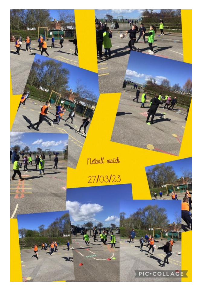
4 - Year 3 netball