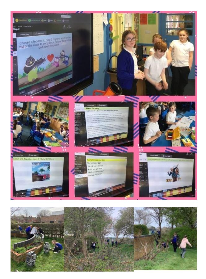
6 - Year 5

We have had a fantastic week this week with lots of lovely work being produced. Our geography looked at earthquakes, which everyone found fascinating. We have also been learning lots about non-chronological reports for our writing and have started to work on decimal numbers in maths. This term has gone really quickly and we have enjoyed seeing all of our pupils' enthusiasm and hard work bringing some fantastic results. We would just like to say thank you for all your support this term and we hope you have a lovely Easter.