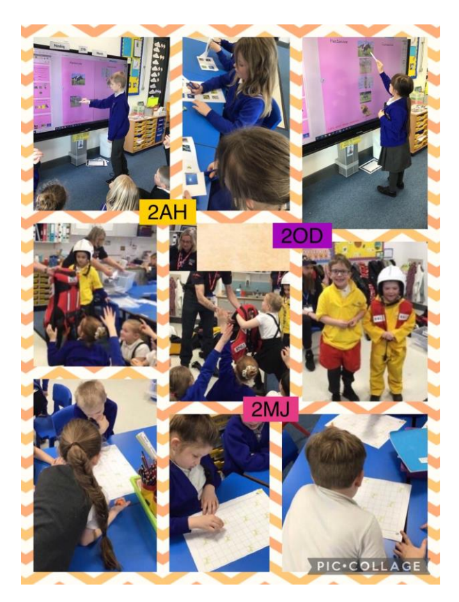
3 - Year 2