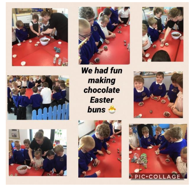
2 - Reception