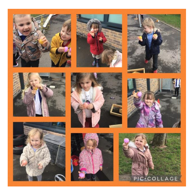
1 - Nursery