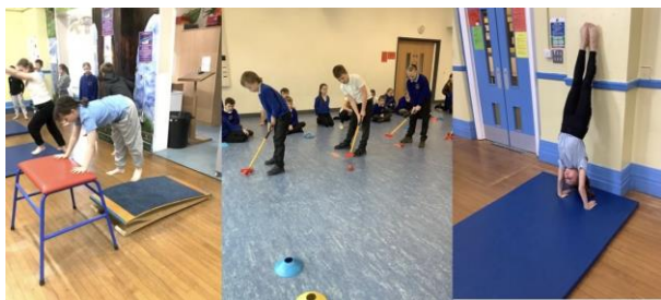
5 - Year 5