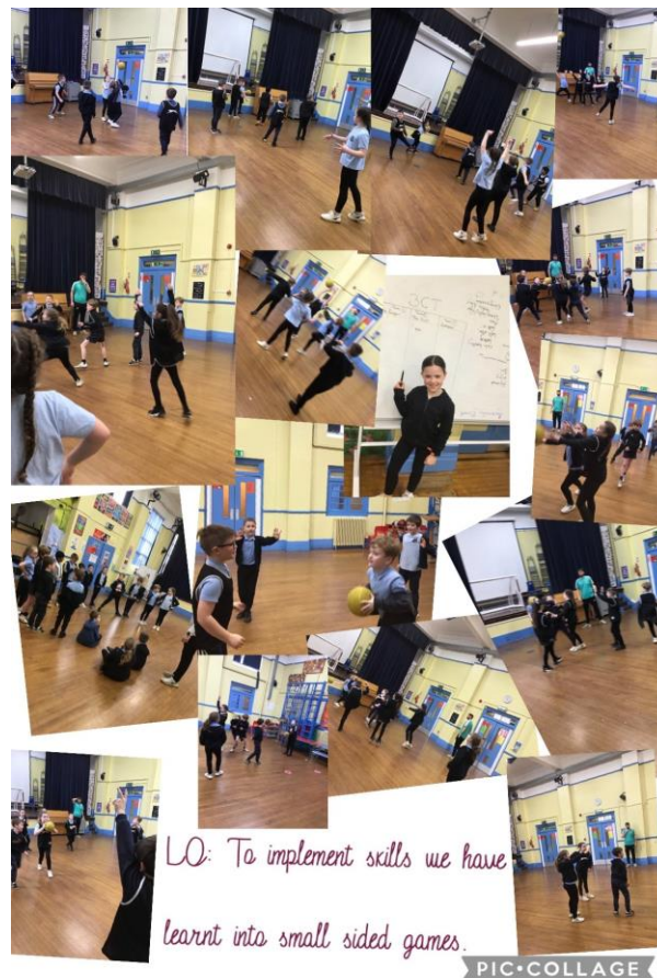
4 - Netball week 4!