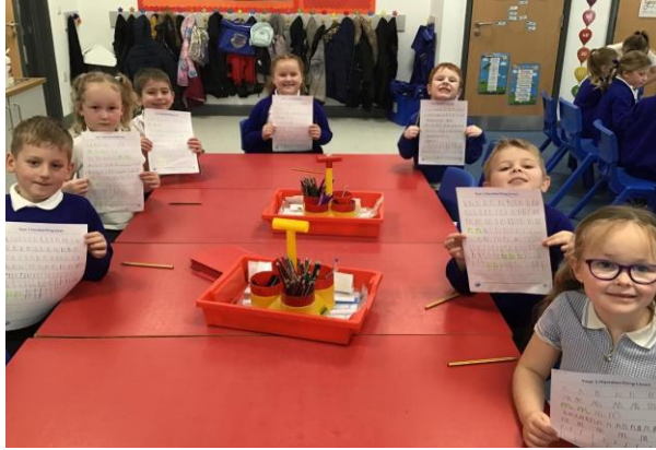
3 - Some lovely handwriting practice in 1SC!