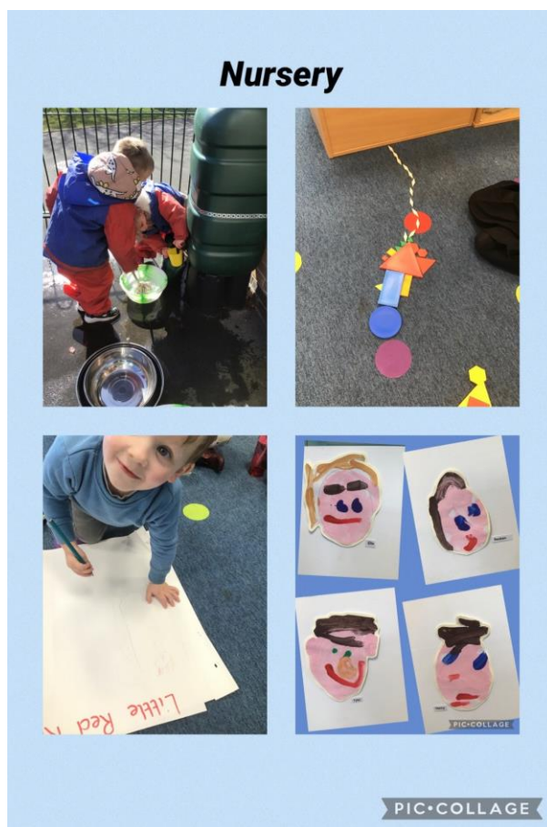
1 - Nursery