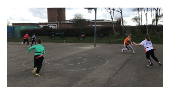
4 - Year 4 - playing tag rugby.

Here's to another fantastic week in Year 4.