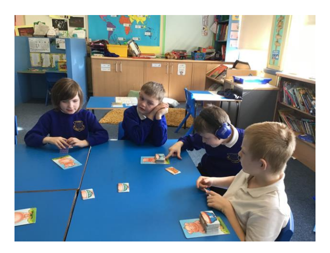
6 - Provision