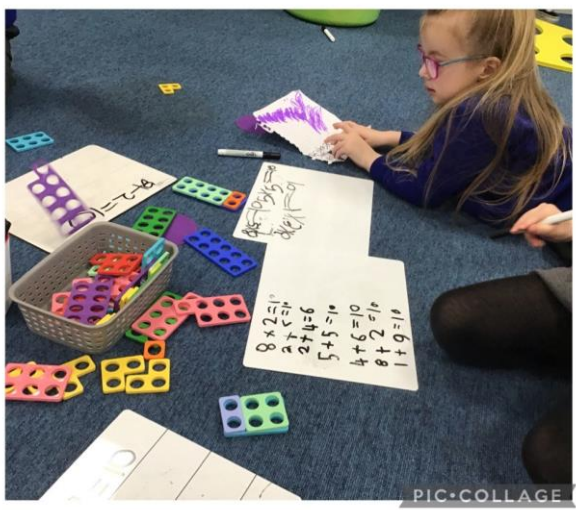
2 - Reception