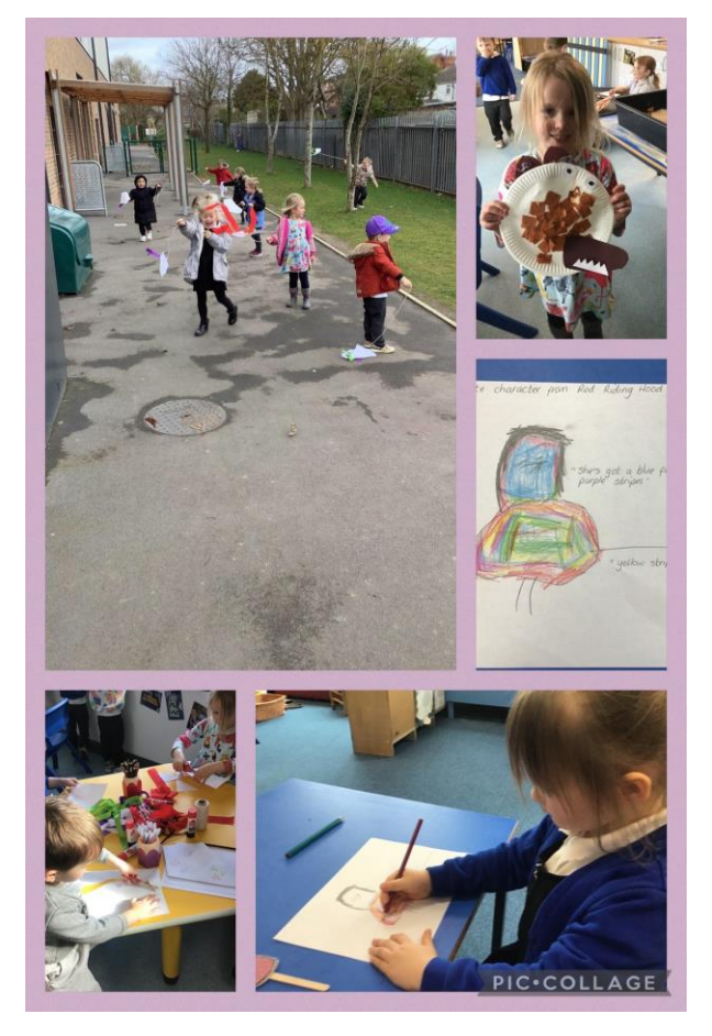
1 - Nursery