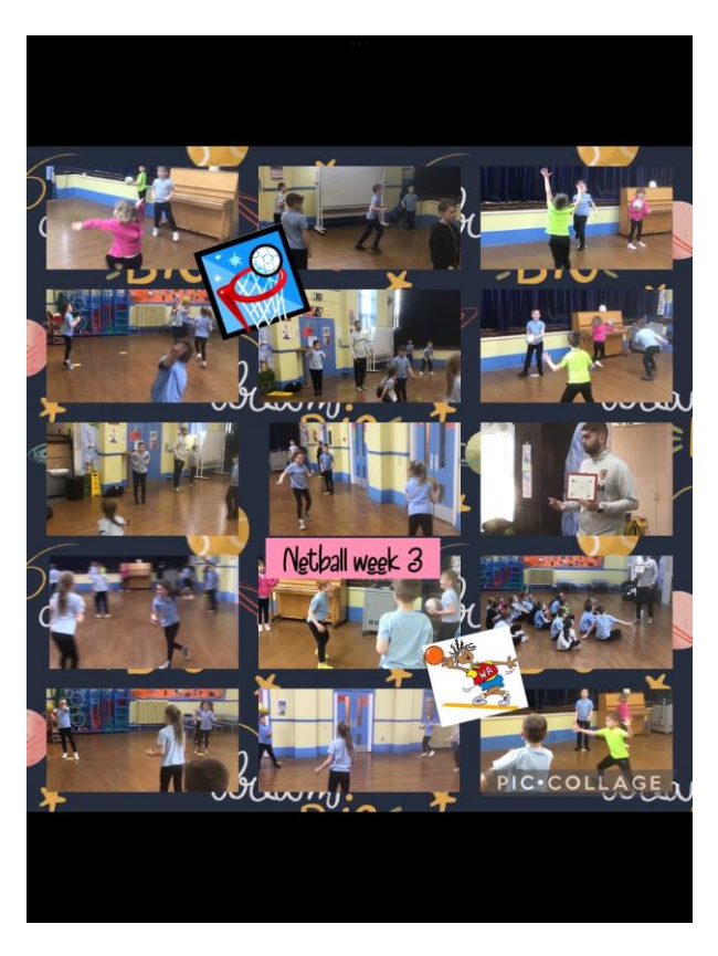
3 - Netball fun!