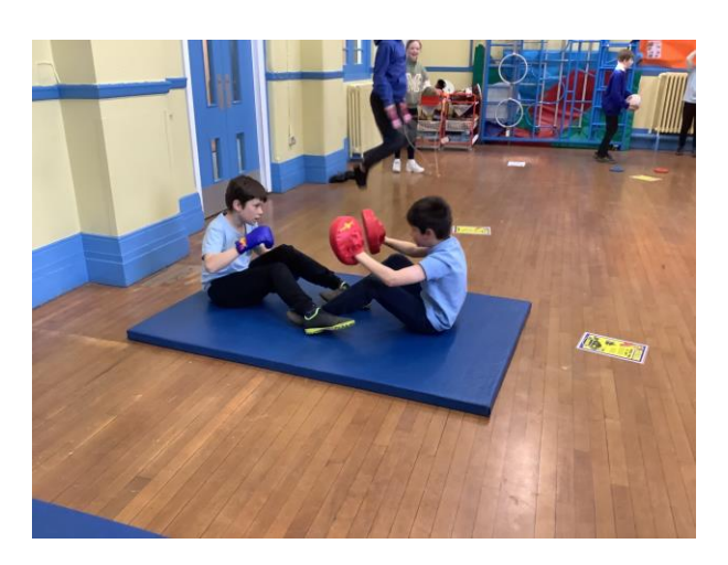
5 - Year 6