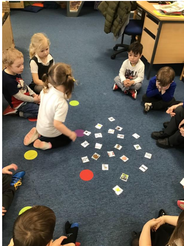
1 - Matching pictures in phonics!