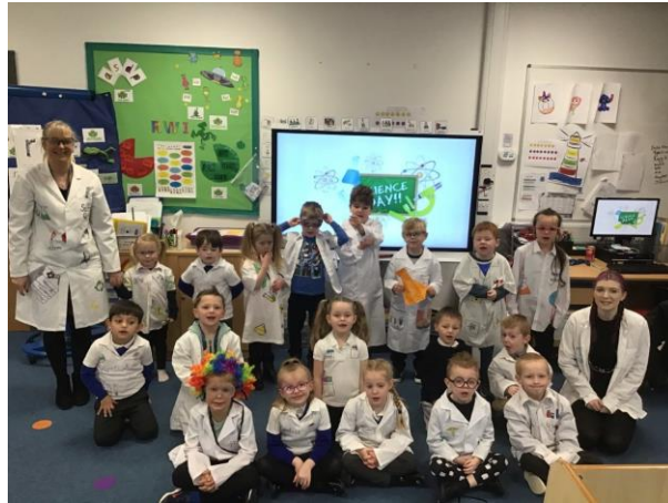
2 - Science Day dress up in RJH