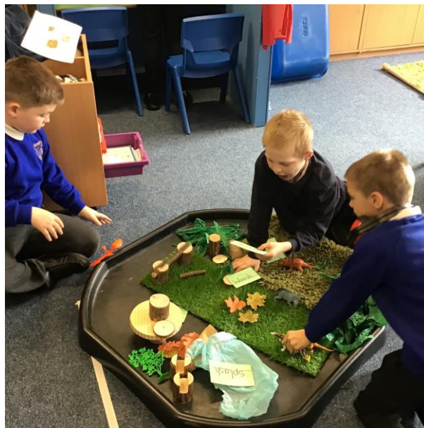
3 - Into Jurassic park! 🦖 🦕