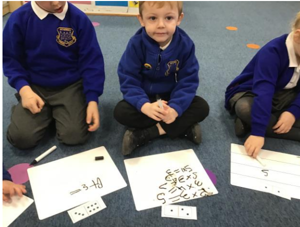
2 - Reception have been working hard to write addition number sentences!