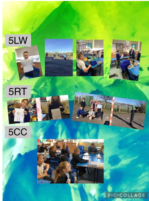
4 - Year 5