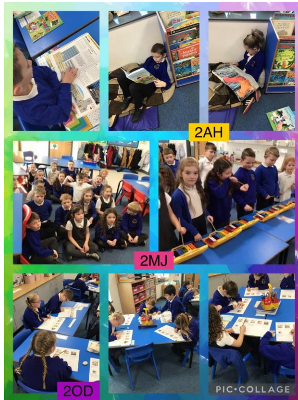
4 - A snapshot of some of our learning this week!