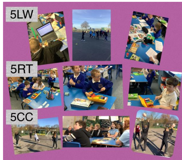
7 - Year 5