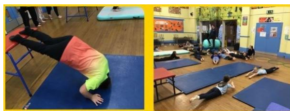
6 - Year 4

We have had such a good week in year 4! In Guided Reading, we are studying the book 'How To Train Your Dragon' and the children are loving how different it is to the film they all know and love. We really try to focus on their understanding of the text and their reading fluency. Maths has been hard this week and the children have showed their resilience in learning new ways to divide 3 digits by 1 digit. Brains have definitely been tested! We have now finished our instruction writing and have moved onto adventure stories. We love teaching this unit as we get to read some amazing writing by our very own Mr Fox. Watch out JK Rowling. The afternoons are always good fun and the stand out lesson this week involved the Anglo Saxons. Ask your children about it.