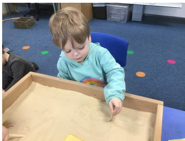
1 - Nursery enjoying playing in the sand.