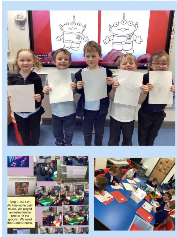
3 - A mixture of the 3 classes enjoying their lessons!