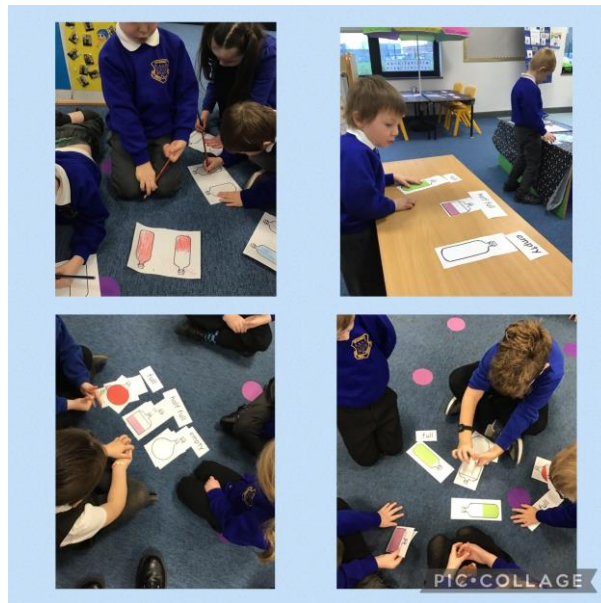
2 - Exploring capacity in maths this week!

The children have loved exploring the sand tray, making patterns and feeling the sand.